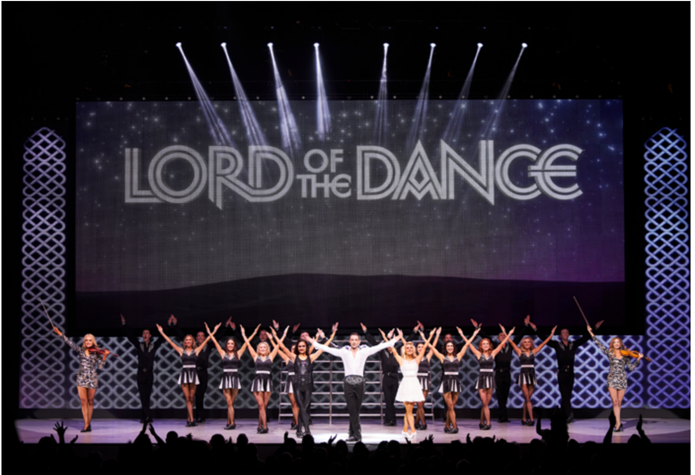
Lord of the Dance returns to Australia in 2025.