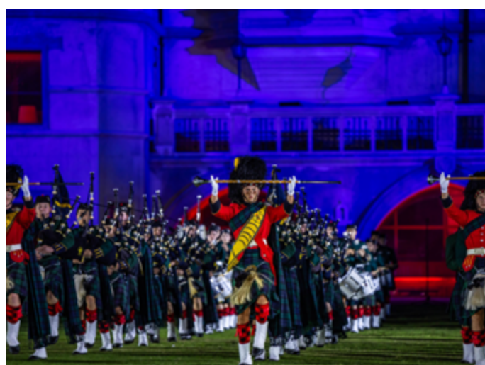
OzScot and The Scots College Pipe and Drums were among the performers at The Scots College tattoo.