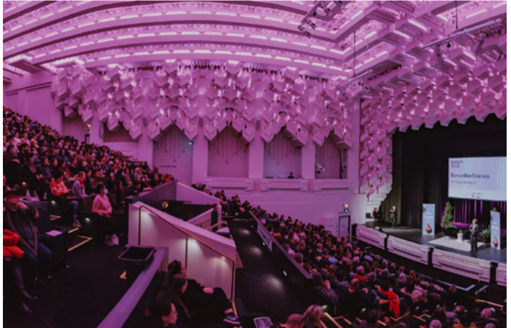
Melbourne Writers' Festival.

At Melbourne Writers Festival, Irish literary titan Colm Tóibín will appear, bringing his mastery of historical fiction and contemporary themes to the stage. Known for Brooklyn and The Magician , Tóibín's session is expected to be a standout, particularly for fans of finely crafted Irish storytelling. Also appearing in Melbourne is Colum McCann, who will be in Australia to promote his new novel Twist – his first visit in 25 years. McCann is scheduled to feature at sever-