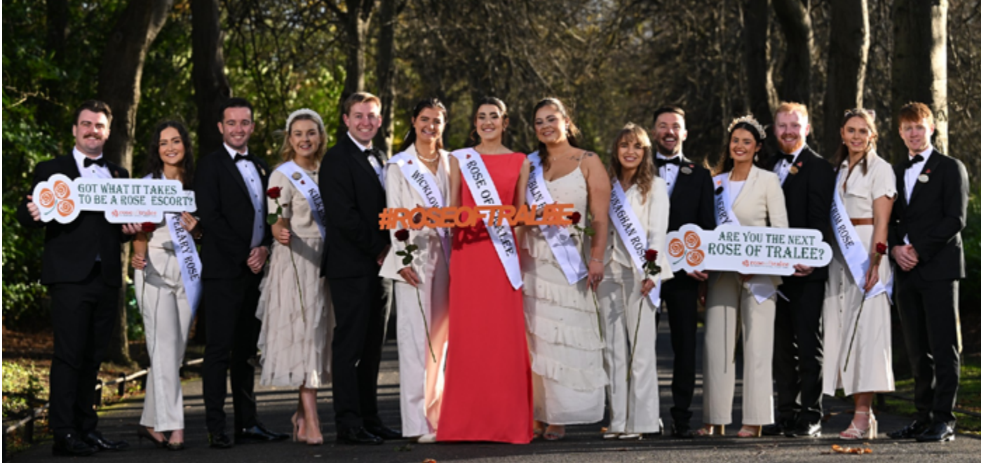
Selection is underway to find the 2025 Rose of Tralee.