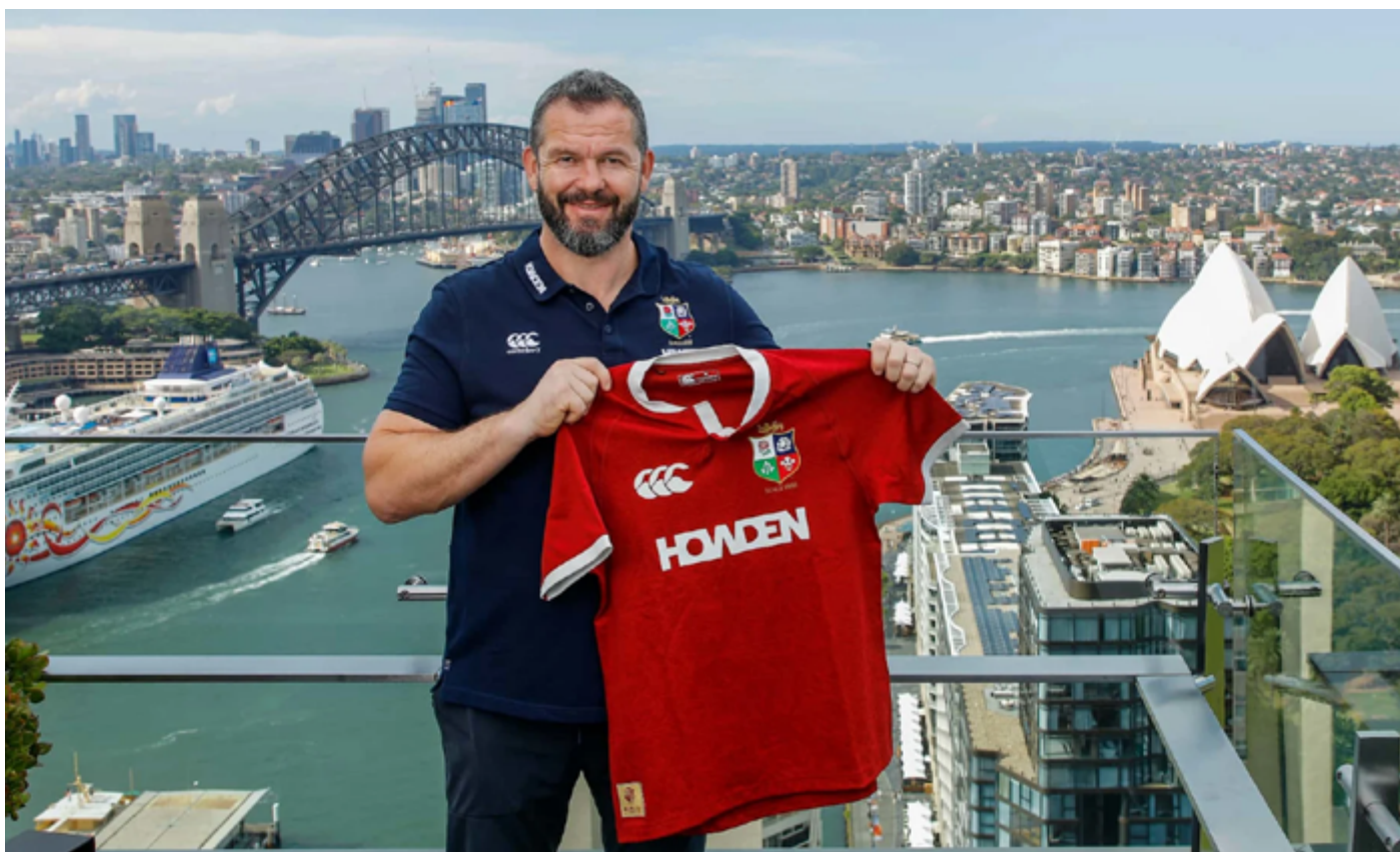
The British & Irish Lions coach Andy Farrell with the team's new jersey.