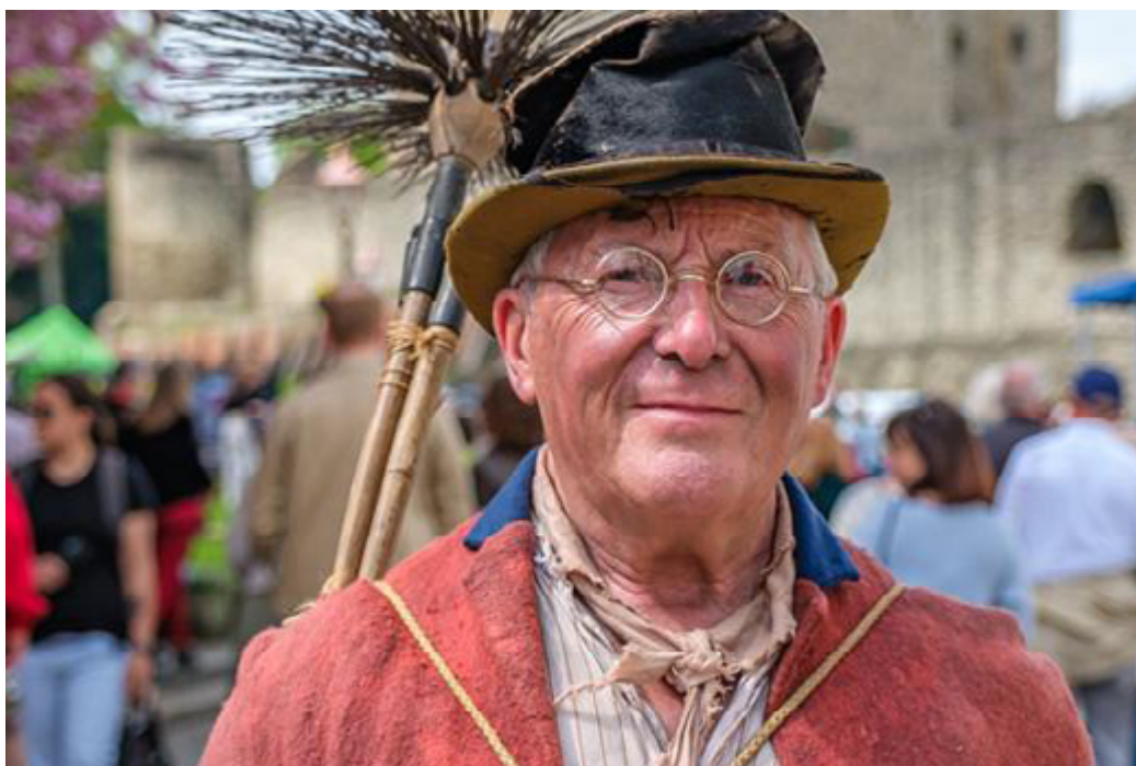
Rochester Sweeps Festival in England.