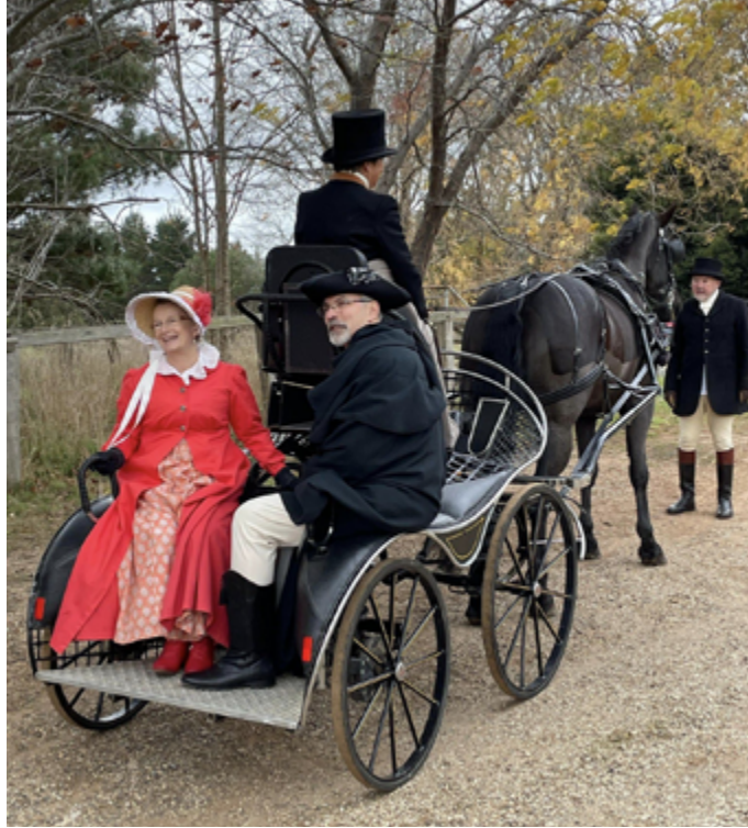
Horse-drawn carriage rides are one of the activities on offer at A Regency Affair.

One of the highlights of the weekend is a special visit to the nearby Golden Vale Homestead, a private