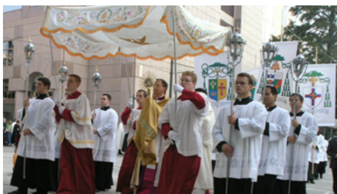
A Corpus Christi Procession in Cork City, Ireland. The celebration sees the Eucharist brought through the streets and it typically takes place in May.

Festival, one of the UK's largest May Day celebrations. The festival commemorates the traditional holiday of chimney sweeps, featuring a vibrant line-up of folk music and dance performances. Activities include Morris dancing, live music, and the iconic Jack-in-the-Green procession, where a performer covered in greenery symbolises the spirit of summer.