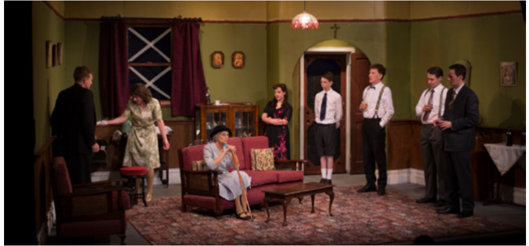
A Happy and Holy Occasion.

As the evening progresses, the family confronts challenging truths, revealing the strains and resilience inherent