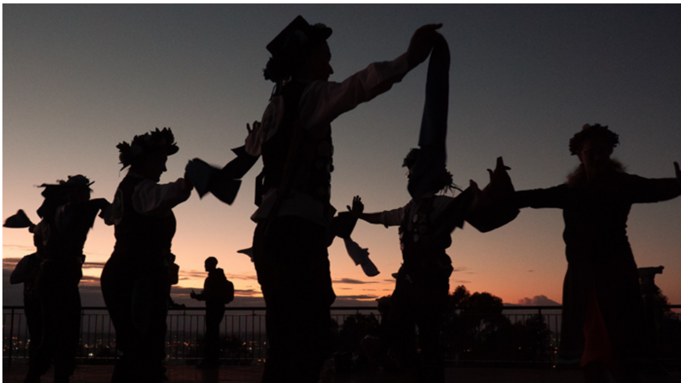
Belswagger Morris dancing up the sun at Mount Coot-tha in Brisbane on the first of May, an annual tradition that is practiced by Morris sides worldwide to welcome the first day of Northern Hemisphere Summer. In 2025, Morris dancing sides across Australia upheld the cherished tradition with dawn performances at elevated locations. Events were held by Belswagger Morris at Mt Coot-tha in Brisbane, Surly Griffin and Limestone Morris at Mt Ainslie in Canberra, Black Joak Morris at Observatory Hill in Sydney, Brandragon, Britannia and Red Raven in Northcote, Melbourne, Jolley Hatters Morris at Mt Wellington in Hobart, and Marlee Morris, Perth Morris Men, Fair Maids of Perth and Mad Tatters Morris at Kings Park in Perth.