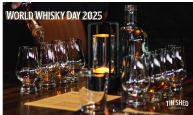
Tin Shed Distilling Co. in the Adelaide Hills offers a special event to celebrate World Whisky Day.

Australia's whisky landscape has evolved remarkably over the past few decades. In the early 1990s, the industry was relatively modest, with limited recognition. However, the emergence of boutique craft distilleries has transformed Australia's whisky production, introducing innovative styles and garnering international acclaim. A pivotal moment came in 2014 when Tasmania's Sullivan's Cove French Oak Single Cask whisky won the prestigious World's Best Single Malt award at the World Whiskies Awards, marking the first time a distillery outside of Scotland or Japan received this honour.