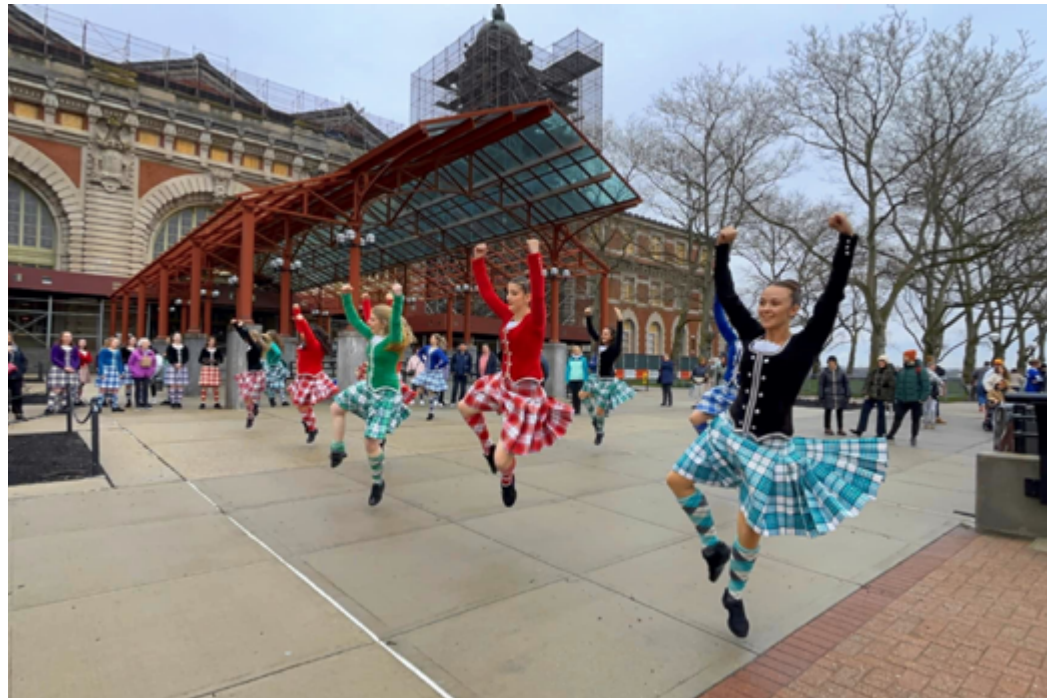
OzScot performing during their trip to Washington.

The mission of The Washington Tattoo is to reshape