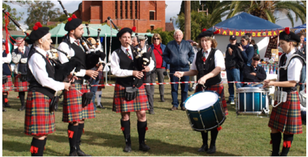
The Bonnie Wingham Scottish Festival.

The festival kicks off at 9am with a full day of Scottish-inspired activities. Watch as pipe bands march through the showground, filling the air with familiar tunes. Traditional Highland dancing will be on display, and you can catch some impressive feats during the Highland Games, where athletes take on the iconic caber toss and tug-of-