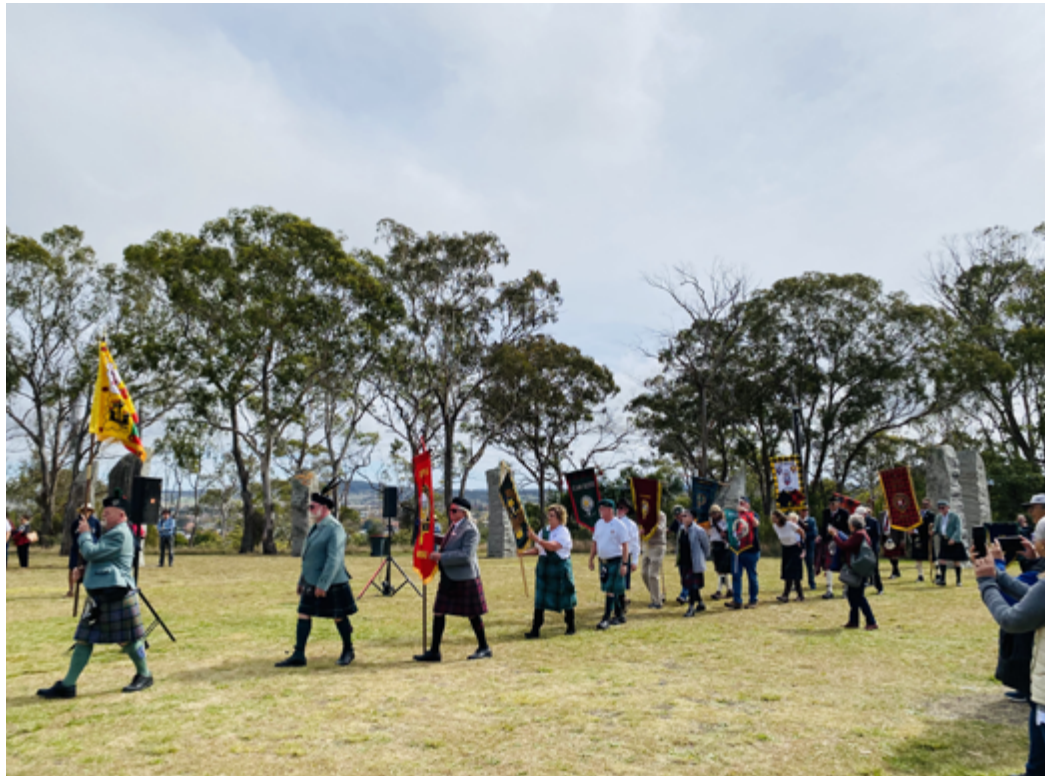
Clans on the march among the standing stones at the Australian Celtic Festival.

But it's not just the headliners that dazzle; local artists add their own flair to the mix. Crowd favourites like Murphy's Pigs and The Gathering will have toes tapping and