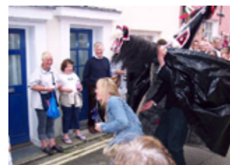
An 'obby' oss captures a passing maiden during the Padstow May-day festival in Cornwall.