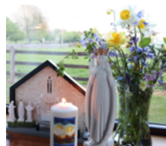
A May altar in an Irish home.