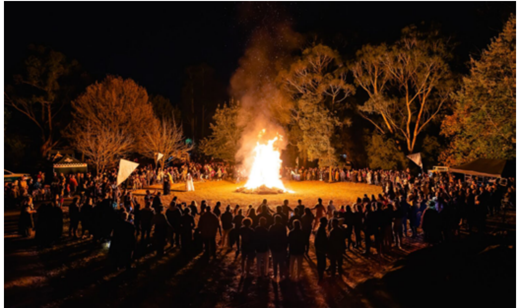
The English Ale brings British traditions to the Adelaide Hills. Pictures show the burning of the wickerman, above, the Mari Lywd, and Preston's Historic Punch and Judy Show.

Throughout the day, you'll be treated to an array of live performances, from soulful