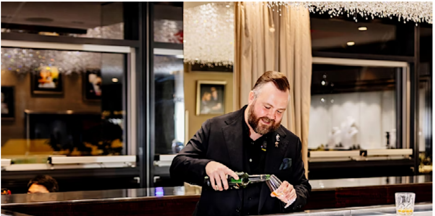
Xennox Diamonds in Brisbane is hosting a World Whisky Day event with premium whisky tastings.