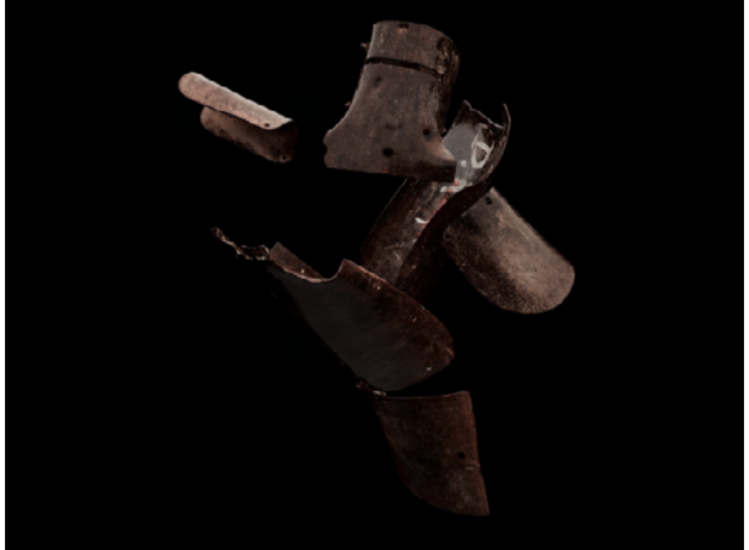
Ned Kelly's armour.

Almost 5,000 photographs of the items were used to generate the 3D representations through a process called photogrammetry, which analyses the similarities between photographs taken from different perspectives. The result is an experience of the objects that would be otherwise impossible – parts of the Kelly collection are on permanent display at the Library and housed under strict preservation settings to