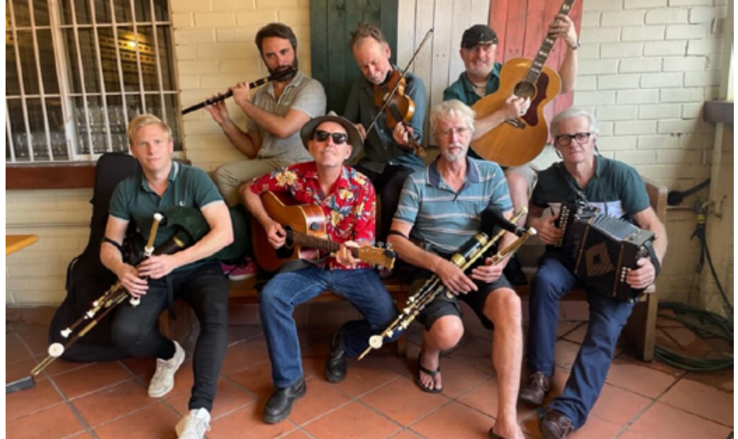
Celtic Tones will be among the artists performing at Lá Bealtaine festival at The Gaelic Club in Sydney.

Performers include Harmony Steps V- Vietnamese Dance, Black Joak Morris dancers, Redfern Shanty Club, Celtic Tones, Na Peacaigh, Black and White