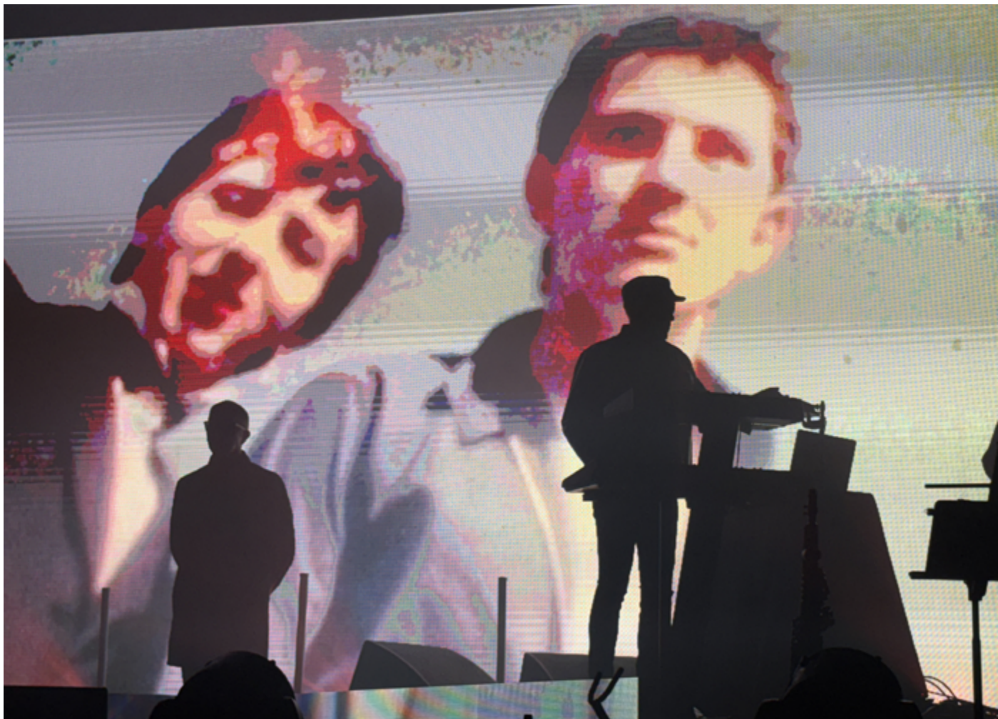
Soft Cell performing at Brisbane's Fortitude Valley Music Hall in April.