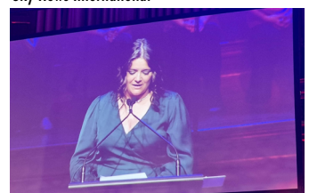
Speech in front of 2,500 at Brisbane City Hall