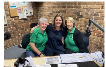
Radio 4EB interview

Half-page feature on your business. Your logo on page 3 of magazine, listed as a bronze sponsor. Quarter-page ad for 12 editions, 5 free gig listings per issue. Online promotion of your business through our website and social media pages. Your logo on our banner at events. Small ad on our state gig guide with link.