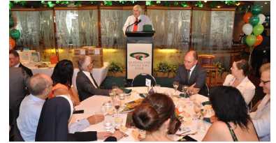
Clive Palmer at St Pat's Day Lunch (organiser/sponsor)