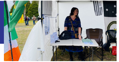
Australian Celtic Festival, Glen Innes (volunteer)