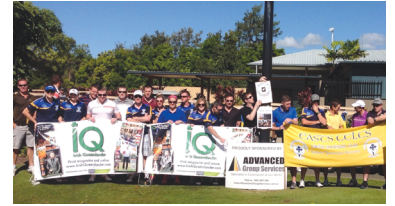
Easts Celts Golf Day (sponsor)