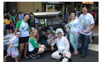
Brisbane St Patrick's Day Parade