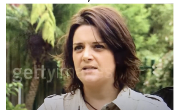
Sky News International