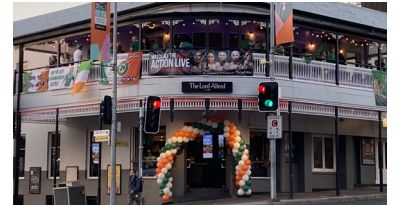
Women's World Cup supporters' party (organiser)