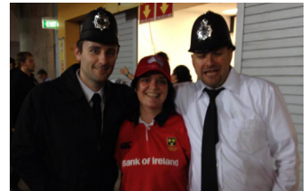
British & Irish Lions